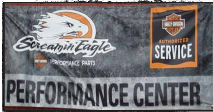
Performance Center w/ Dyno Lab

Our team of professionals will treat your Harley-Davidson® motorcycle with total care – providing everything from routine service and accessory installation to powertrain enhancements. Whatever you need, we'll get it done right!